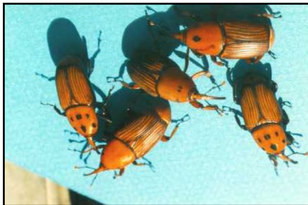
Figure 3. Cocoons and adults of R. ferrugineus . (A) Cocoons, (B) Emergence of an adult, and (C) Adults.