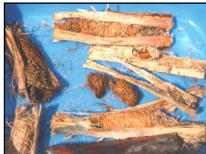
Figure 5. Development of R. ferrugineus larvae on sugarcane stems.