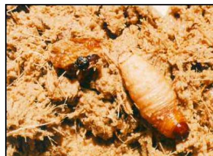
Figure 6. Development of R. ferrugineus larvae on an artificial diet.