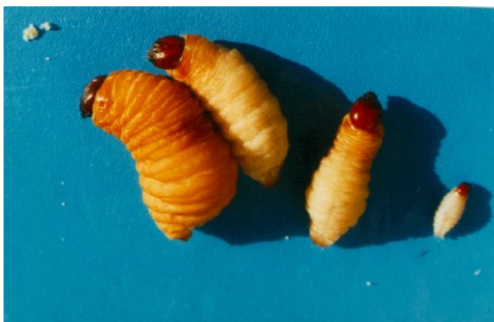
Figure 1. Different larval stages of R. ferrugineus .

Insects used in this study were originally obtained from infested palm trees in Masafi area in the Sharja Emirate in 1997. Insect culture was maintained in a rearing room, at the Plant Protection Laboratory, at 24\pm 2^{\circ}\text{C} , 70\pm 5\% RH, and a photoperiod of 12 : 12 (L:D) h. Larvae (Figure 1) were provided with sugarcane for feeding, while the adults with cotton wicks saturated with a sugar solution for feeding and egg laying. Adults were sexed after emergence from cocoons and kept separately in small jars prior to the beginning of the observations. Sexing of adults was done according to the presence of a series of black hairs on the dorsal, frontal part of snouts of males and their absence in the females (Figure 2).