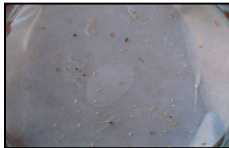
Figure 4. Deposited eggs on filter papers.