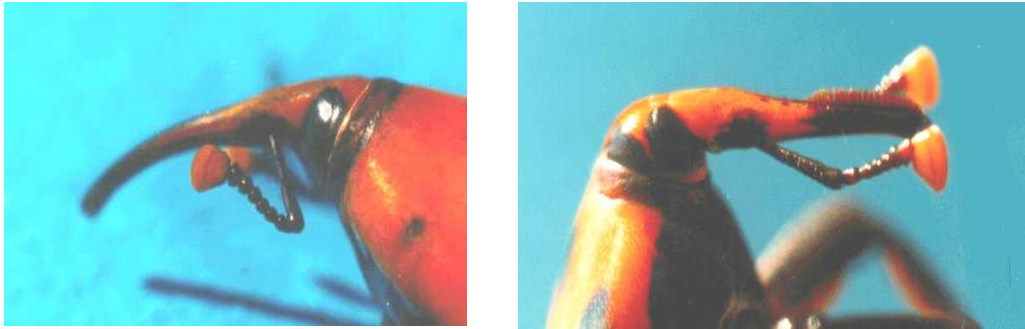
Figure 2. Male (right) and female (left) R. ferrugineus . Males are characterized by the presence of a series of black hairs on the dorsal, frontal part of snouts; females do not have hairs.